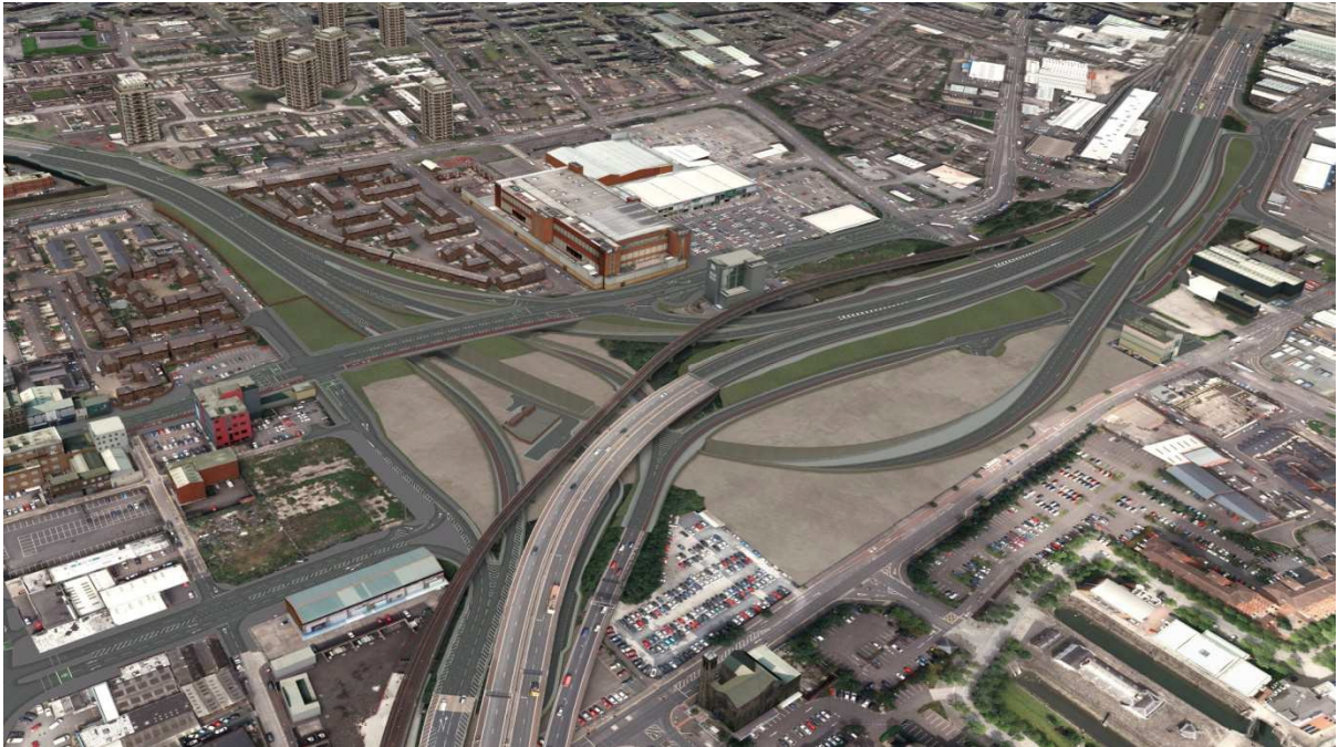
Preferred Option to improve York Street Interchange

Delivery of the York Street Interchange scheme remains a high priority for the Department. This scheme will address a major bottleneck on the strategic road network, replacing the existing signalised junction at York Street with direct links between Westlink, M2 and M3, the three busiest roads in Northern Ireland.