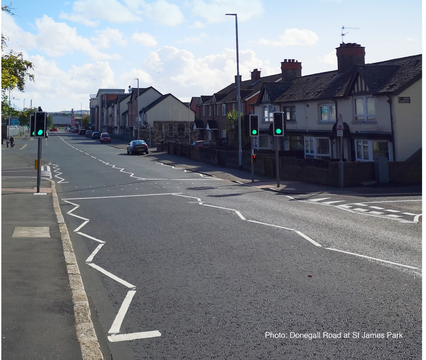
Photo: Donegall Road at St James Park

Report to BELFAST CITY COUNCIL Autumn 2020