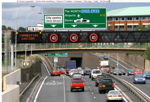
M1 / A12 Westlink Managed Route