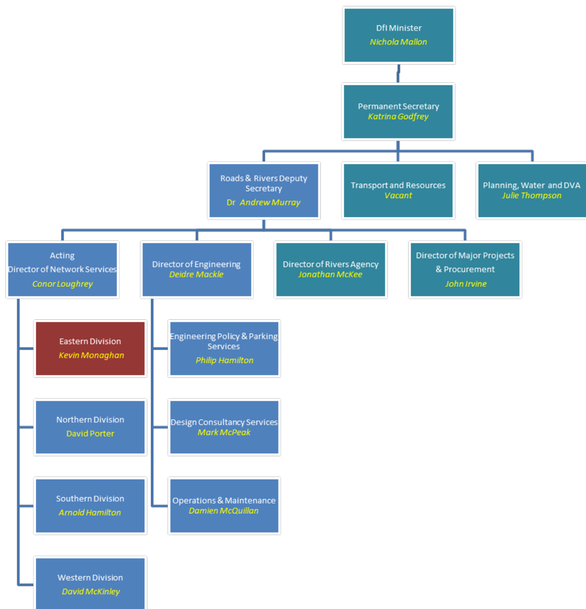
Figure 1 – Organisation Context

Eastern Division is part of the Roads structure, within the Department for Infrastructure, made up of separate business units (within Network Services Directorate) for those who order services and for those who provide services in the Engineering Directorate ((Design & Consultancy Services and Operations & Maintenance) (see figure 1 below).